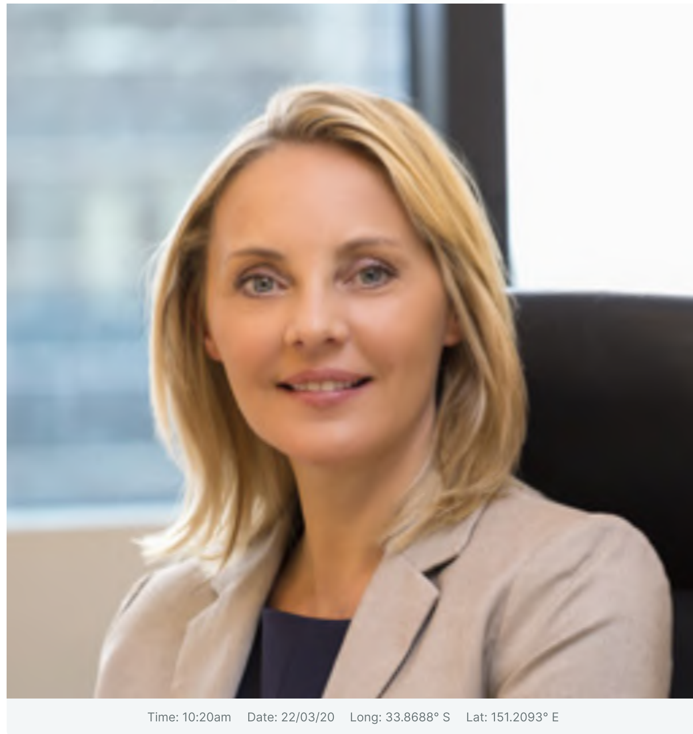
Time: 10:20am Date: 22/03/20 Long: 33.8688° S Lat: 151.2093° E